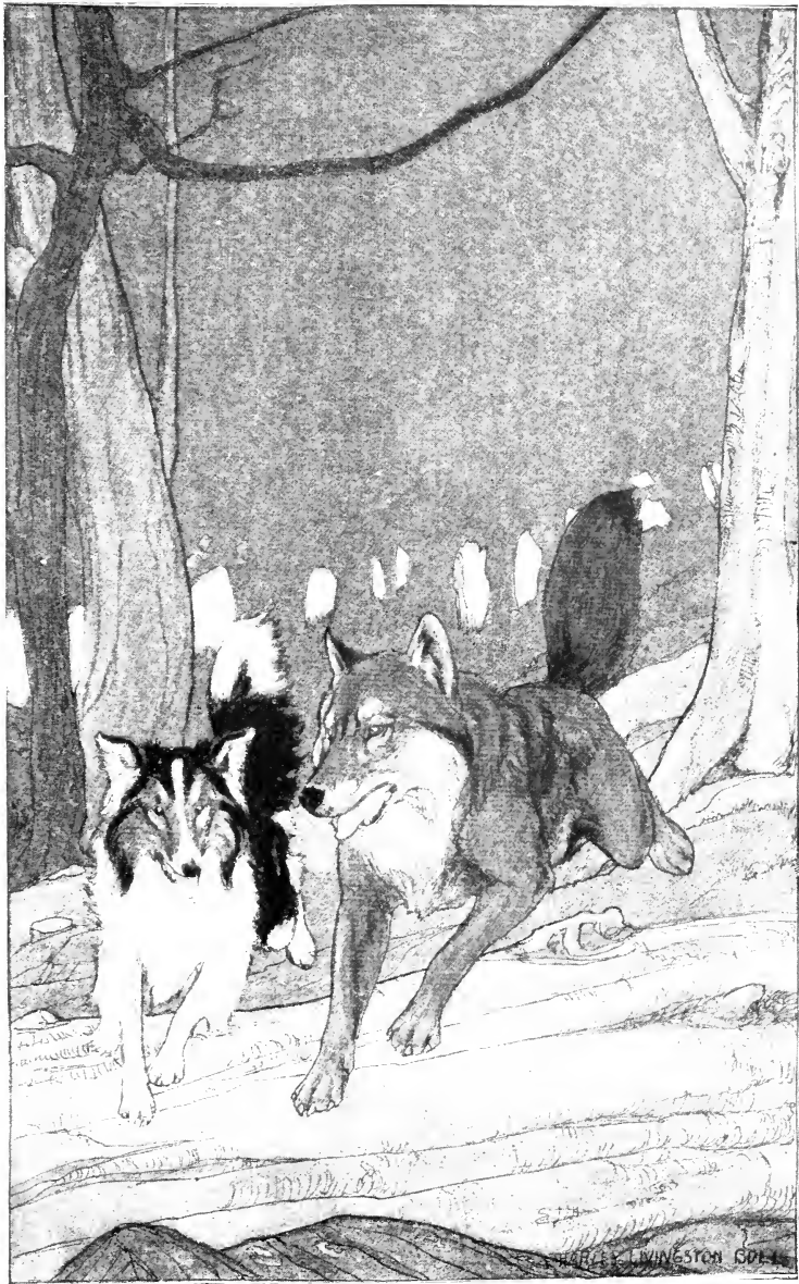
“In the woods, side by side, White Fang ran with Collie.”